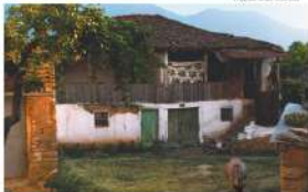
A typical house in Srebren

Michael Jackson was born prematurely in a poor family, in the village of Srebren in Macedonia, at the foot of the Baba Planka (The Grandmother Mountain).